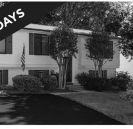
8463 Rippled Creek Court