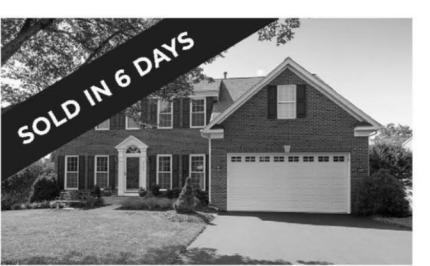
8566 Fisher Woods Drive