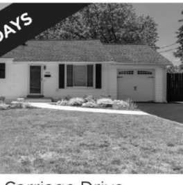
6510 Carriage Drive