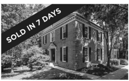
7471 Collins Meade Way