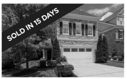
5964 Manorview Way