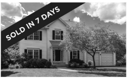
8216 Franklin Drive